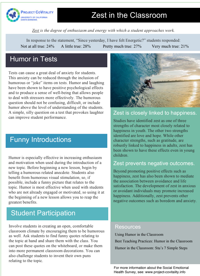
Figure 1. Example of Zest Information Handout. Also, see http://project-covitality.info/prevention-and-intervention/covitality-resource-list.pdf for additional information and strategies for the 12 Covitality Mindsets.

Twelve handouts were created summarizing classroom-based interventions and